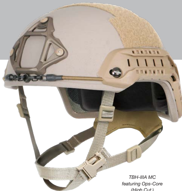
TBH-III A MC featuring Ops-Core (High Cut)