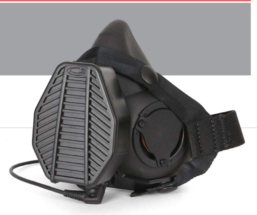
The low profile, streamlined design of the Ops-Core SOTR offers protection without interfering with operator's tactics, techniques, and procedures (TTP) and seamlessly interfaces with weapon systems.

The Ops-Core® Special Operations Tactical Respirator (SOTR) is a half-mask respirator designed to provide protection against a wide range of oil and non-oil based particulate contaminants encountered by Special Operations forces during training and in operational environments. The Ops-Core SOTR offers 99.97% filtration efficiency against airborne particulates including lead, asbestos, fentanyl, lubricant mist, and explosive gunfire residue. The low profile design offers protection without interfering with operator's tactics, techniques, and procedures (TTP) and seamlessly interfaces with weapon systems for optimal effectiveness. Includes easy to adjust suspension straps to be worn with our without a helmet. Also available with or without a microphone (compatible with standard ground communications headsets) to enable radio communications.