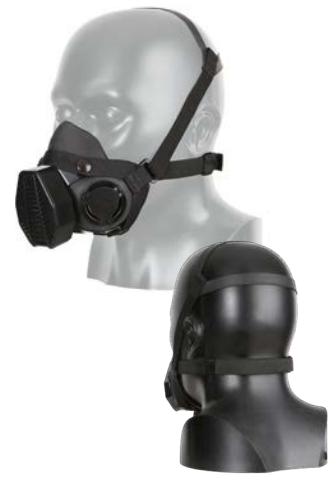
Shown with Head Suspension Straps